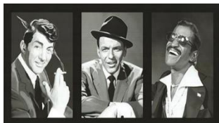
Rat Pack Flashback™ The Music of Dino, Frank, & Sammy

WEDNESDAY, JUNE 21, 5:30 PM* - 9:00 PM Registration required by June 11